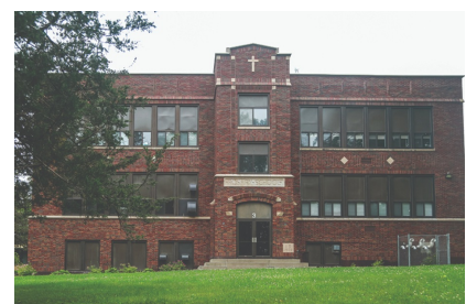
St. Dominic School