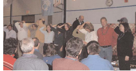
Heads or Tails Game

Saints Night Out St. Dominic School Auction February 23, 2008 Buffet Dinner 5 - 7 pm Silent Auction 5 pm Live Auction 8:30pm Tickets $10 Call: 645-8136