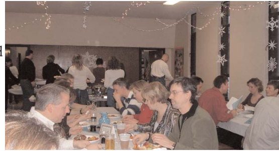
Attendees enjoy a fabulous dinner buffet!

Special Thank You to Konica Minolta 952-820-8385 for printing the newsletter.