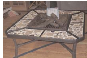
Firepit - All school project

The money raised allows the school to continue its mission of developing Northfield area students who are focused on academics and dedicated to service and community. Thanks to ALL the tremendous people who donated their time, money or items. Please join us February 23rd for another fun Saints Night Out!